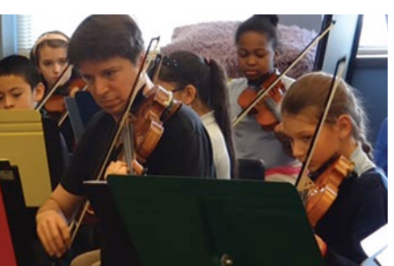
Rosa Parks Bravo Youth Orchestra enjoyed a visit from none other than