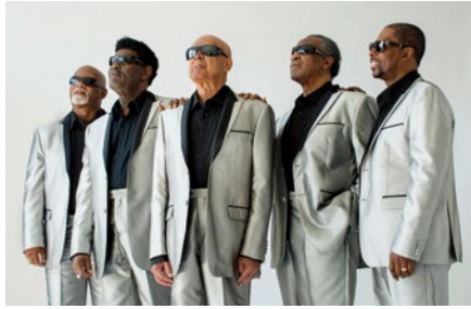
Blind Boys of Alabama

Classical subscription revenue up 5% Classical ticket revenue passes the $3 million mark