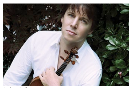
Presented our most diverse programming ever, with our first foray into country western.