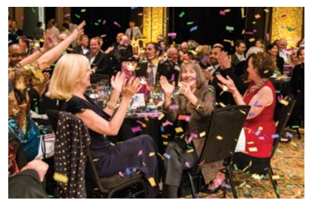
400 attendees at the Annual Gala had a celebratory time and set a new Gala record — $870,000 in contributions.

The total annual budget of $16,665,775 included artistic programming, musician salaries and benefits, community programs, and all administrative costs.