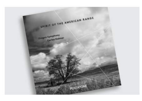
The latest CD — Spirit of the American Range garnered another Grammy award nomination for Best Orchestral Performance.